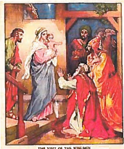
THE VISIT OF THE WISE MEN